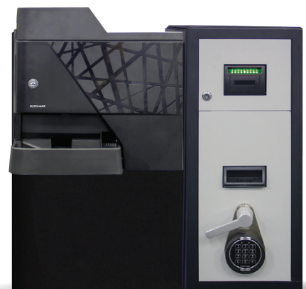
SPS-300 Paired with the CRS-600

SUZOHAPP: 1743 Linneman Rd. Mount Prospect, IL 60056 USA T 888-289-4277, info@suzohapp.com Go to www.suzohapp.com for more information